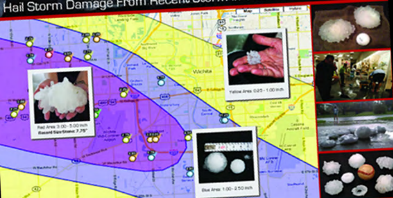
Hail Storm Damage From Recent Storm In Wichita

www.STORM-HAWKS.com Storms@Storm-Hawks.com